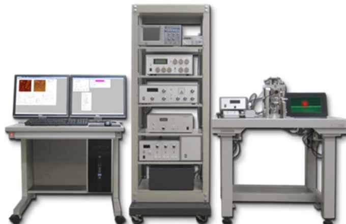
Fig. 2. High-speed AFM NanoExplore™

The market of conventional AFM has been maturing, resulting in intense price competition and a shrinking market. Under such circumstances, NEX that has brought a qualitative change from still to video imaging is now creating a new growing market. In fact, NEX has already been sold to a number of domestic and overseas institutions. The overseas countries include Australia, Canada, France, Netherlands, Switzerland, United States and others. There are overseas laboratories that have purchased