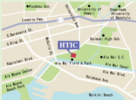
Location of HTIC

ISABMEC2014 is now planned to be held at HAWAII TOKAI INTERNATIONAL COLLEGE (HTIC) located at 2241 Kapiolani Boulevard, Honolulu, Hawaii 96826, U. S. A.